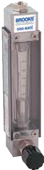
Sho-Rate™ Model 1358