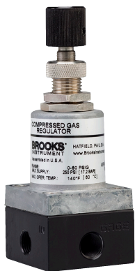
Model 8601 Pressure Regulator