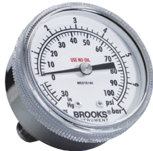
C122 Pressure Gauge