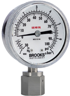
S122 Pressure Gauge