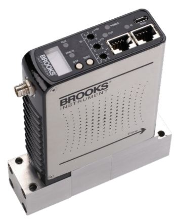
Figure 2-2 – M8 Power Connector Location

Power needs to be supplied via the standard male M8 5-pin connector. The M8 connector is located on the upper inlet side of the device. Refer to Figures 2-2 and 2-3 below.