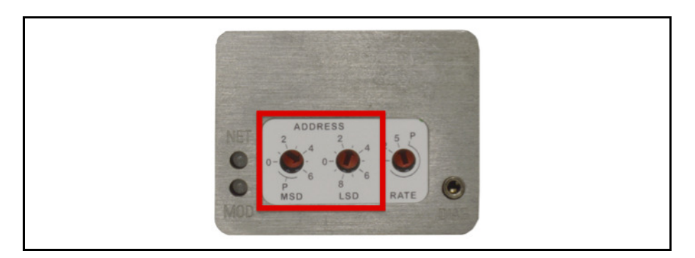
Figure 3-2 MAC ID Switches

The switch labeled "LSD' sets the least significant digit of the MAC ID. The out-of-box default setting for the MAC ID is 63.