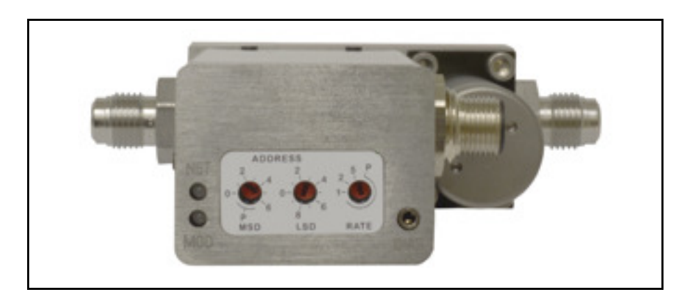
Figure 3-4 View Showing Top of MFC/MFM Can

Two LED's are provided to indicate network status and module status, labeled "NET" and "MOD" respectively. Appendix D provides a table of flash codes for each of the LED's.