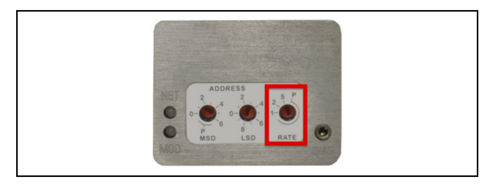
Figure 3-1 Baud Rate Switch

The switch labeled "RATE" sets the baud rate of the MFC. Possible values along with their corresponding label are (see figure below): "1" = 125K baud, "2" = 250K baud, and "5" = 500K baud, "P" = Software programmable where DeviceNet communications may be used to set the baud rate to one of the above values. The out-of-box default setting is 500K baud.