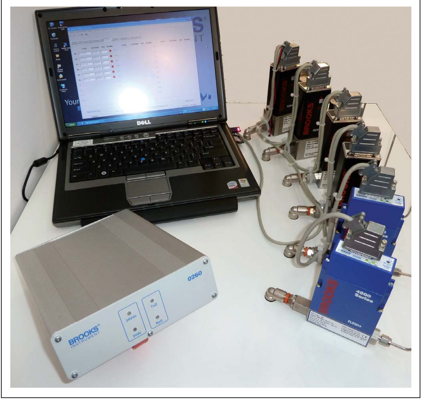
Figure 1.2 PC with Brooks<sup>®</sup> 0260 Secondary Electronics and Devices 1.6 Control Smart Interface from Another Application

The basic functions of the Brooks Smart Interface application can be controlled by another application. For more information on this you're referred to the 'How to Control Brooks Smart Interface from a separate program' help page. The LabVIEW application described in this help page is available in '<Program Files>\Brooks Instrument\SmartInterface\Examples\ClipBoard WriteRead.vi'