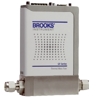
GF40 Series MultiFlo™ Thermal MFCs

Proven MFC for widest range of mass flow needs and applications delivers superior results and lower total cost of ownership.