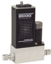
SLA Series General Purpose Thermal MFCs

Proven MFC for widest range of mass flow needs and applications delivers superior results and lower total cost of ownership.