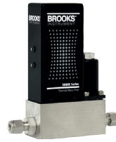
5850E Series Analog Thermal MFCs

Multiple gases and flows in one device maximizes process flexibility and productivity while preserving accuracy, all in a compact footprint.