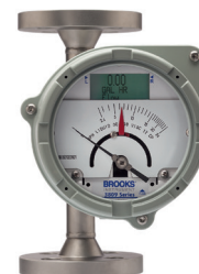
MT3809 Series Metal Tube VA Flow Meters

Widest temperature, pressure and flow ranges for measuring fluids in hazardous, remote areas.