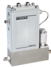
SLAMf Series NEMA 4X/IP66 Thermal MFCs

Extremely reliable, accurate and repeatable measurement and control for demanding industrial processes.