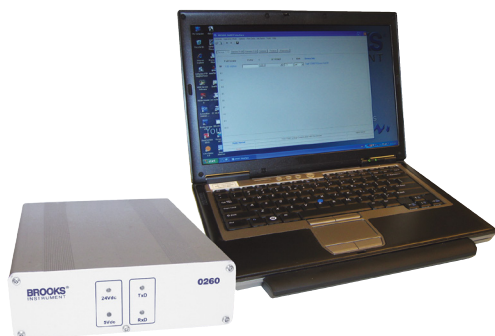
Model 0260 Secondary Electronics with PC